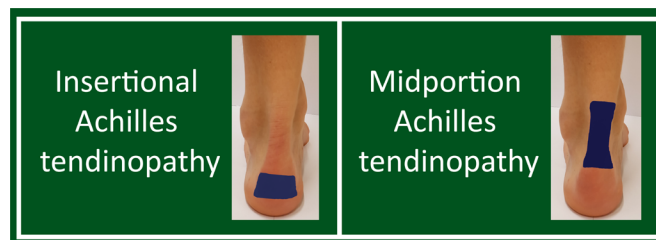
Figure 1 Distinguishing Achilles tendinopathy based on location of the symptoms. Insertional Achilles tendinopathy is localised within the first 2 cm of the attachment of the Achilles tendon on the calcaneus (left side figure) and midportion Achilles tendinopathy is localised >2 cm above this attachment (right side figure).

The working group defined insertional tendinopathy as symptoms localised within the first 2 cm of the attachment of the Achilles tendon to the calcaneus. There may be a tendinopathy of the Achilles tendon insertion, an associated prominence of the calcaneus (Haglund morphology) and/or an associated retrocalcaneal bursitis. 12 The working group defined midportion tendinopathy as symptoms localised >2 cm above the distal