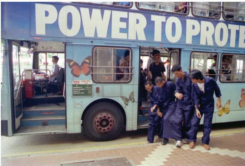
Figure 2: Four Men in One Suit in the Streets of Singapore (1991): Part of A Sculpture Seminar , National Museum Singapore and around the city.

Four Men in One Suit in the Streets of Singapore was a collaborative work akin to Grant Kester's notion of dialogical art 31 and Eco's open work. This work de-emphasised aesthetics; we encounter a group of artists who designed movement, gestures and a series of awkward and reflexive actions to jolt the alienated viewer into a new awareness and reflexiveness towards one's public spaces. The work can be read as a shifting or mobile public artwork, enabling a social commentary through banality and humour in repositioning this temporal form of site-specific art as a discomposure , despite being limited in their inability to enact any real change to policies or political decision-making. The performance and its subsequent documentation pointed out social issues where the self-deprecating "public artists want(ed) the viewer to move from their familiar boundaries, out of common language and existing representations" 32 to assess their current predicament or social situation. The resultant series of photographic artworks stems from Tang's deep concern with contemporary social issues, where the provocative and playful images produced became open-ended commentaries on issues witnessed in the public sphere.