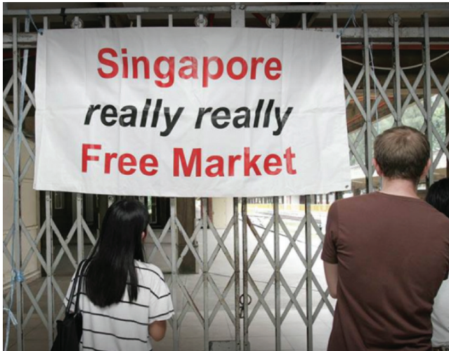
Figure 4: Post-Museum's SRRFM Space at /*semble*/ held at the Former KTM Tanjong Pagar Railway Station in 2015.