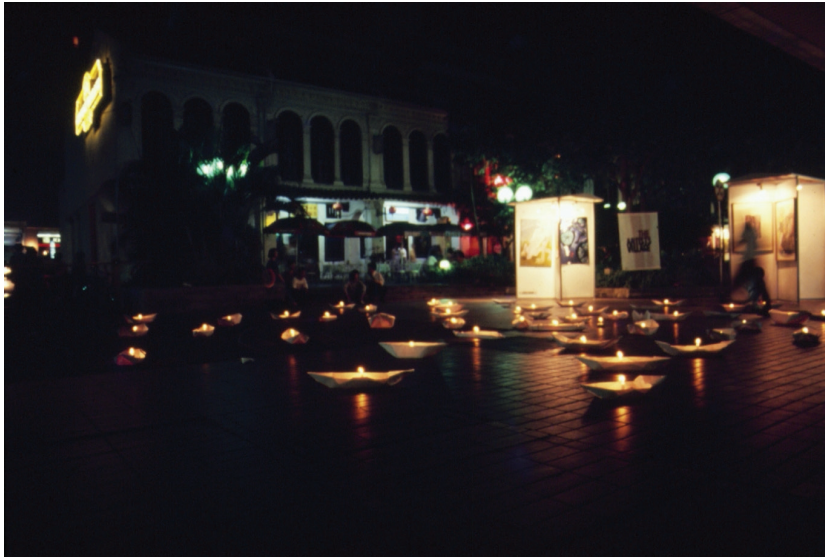
Figure 1: Life Boat : Part of Art Mart: Singapore International Shopping Festival at Cuppage Terrace, in the shopping district of Orchard Road, in 1989.

In Miwon Kwon's 27 concepts of geographical locales and artistic production she considers site-specificity as a precise discomposure between the artwork and its site. Life Boats was set within a construct of a shopping festival and sited in a place of commerce and consumer culture, starkly contrasting the deeply troubling crisis faced by the refugees 28 in Vietnam against the commercial locale. The involvement of the general public, their oblivion or participation, presented an urgency for site-specificity where the production of a ritual or social gathering to commemorate the crisis is juxtaposed uncomfortably against the consumption of art (objects) in the Art Mart . The example of Life Boats (1989) presents one of the first critical artistic intervention by the artists in and around a shopping mall, where the commentary or provocation of the Indochina refugee crisis is embedded in a noisy procession of songs, quiet participatory work, and poetic lights set within a space of unconditional publicness. The historiography of the artists collective will be explored in other papers, but this work exemplifies the artists' exploration of interfacing with the realities of the city-state, where an urgency to reach out to the general public created a certain measure of discomposure through the participatory art project.