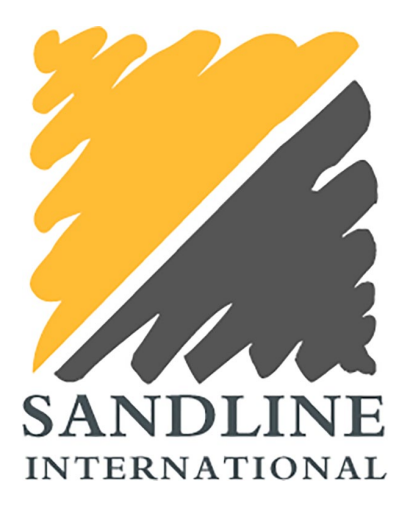
Figure 2. Sandline's logo.

Like that of Executive Outcomes, Sandline's unimpressive logo, consisting of the combination of brush strokes and type shown in Figure 2, conveys no direct association with the provision of combat. Sandline's representamen, showing a line in the sand, is iconic to its name. Symbol and type are therefore linked by mutual determination. Object and interpretant, however, are ambiguous. Although drawing a line in the sand is a figure of speech evoking staunch resolve and was reportedly used by US soldiers at the Battle of the Alamo to epitomize their refusal to surrender, name and logo alone hardly suffice in identifying Sandline as a provider of military services. As in the case of EO, however, the choice of a text in capital letters anchored at the bottom of a large icotype draws on the visual semiotic codes of the military professions. The chromatic juxtapositions of two mimetic colours forming a quadrangular shape with a text at the bottom bears an even closer resemblance to uniform patches, thereby indirectly revealing proximity to military visual identity systems.