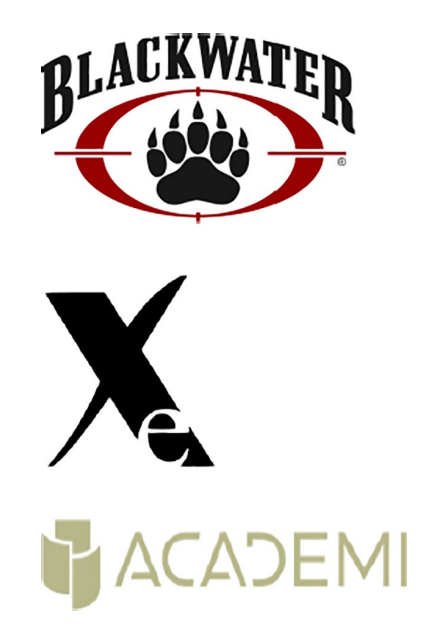
Figure 3. From Blackwater to Academi.

Blackwater's logo is not just an iconic representamen of an animal paw: its interpretant clearly conveys a sense of urgent danger. The red shooting frame can be seen as indexical for the provision of armed services, thereby pointing to the need to anticipate risk by proactively resorting to lethal force. Today's battlefield has been reconstructed as a hunting ground (Guillaume et al., 2016). The usage of visual artefacts borrowing from hunting, however, does not only metaphorically evoke war. Hunting symbols effectively resonated with the visual identity of Blackwater's prospective customers and employees, conveying a familiar message to the population of male American individuals with a military background who could either hire Blackwater as US government officers or work for them as guards.