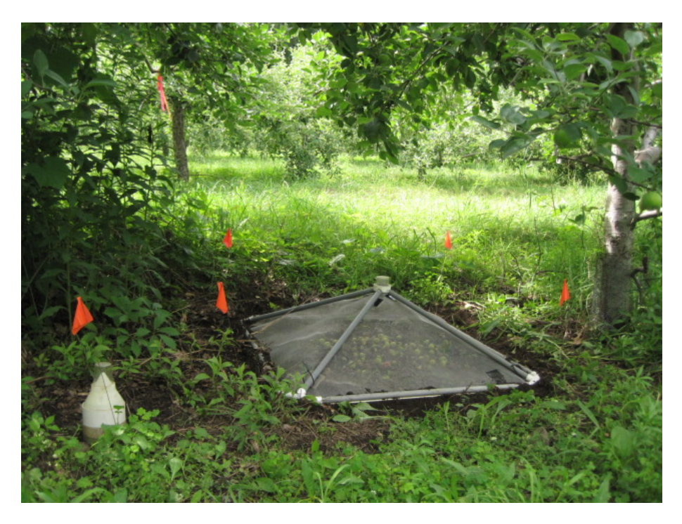
Figure 1. Depiction of the polyvinyl chloride (PVC) enclosure ( left ) and pyramidal emergence cage (1 m \times 1 m at the base) ( center ) used for the evaluation of entomopathogenic nematodes in the second study.

Experiment 2. The 2019 experiment aimed to compare the effectiveness of commercial formulations of S. riobrave, S. carpocapsae (Weiser), and S. feltiae against a water control, using pyramidal emergence cages. The virulence of the three EPN species evaluated was quantified in a preliminary test under laboratory conditions using greater wax moth, Galleria mellonella , (L.) (Lepidoptera: Pyralidae) larvae, a highly susceptible host. The moth larvae were purchased from Bestbait (Lakeside Marblehead, OH, USA). Ten G. mellonella larvae were placed on Petri dishes (10 cm diameter), loaded with 1.5 cm of moist sand, and 20 mL of each of the three EPN species (rate: 100 IJ/cm<sup>2</sup>) or the water control was applied to different Petri dishes. Each treatment was replicated 4 times. All three EPN species caused 100% mortality of G. mellonella larvae within 24 h, confirming the strong activity of the commercial formulations of EPNs used for the field study.