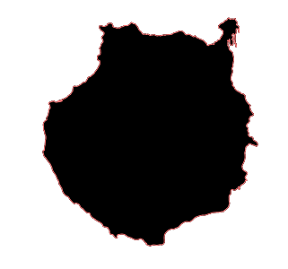
(b) Triangulation generated with FreeFem++[13] from the image of the left (88018 triangles).