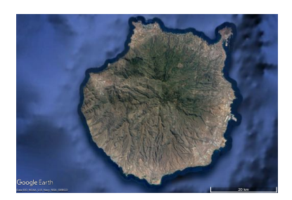
(a) Image of Gran Canaria island generated by Google Earth.