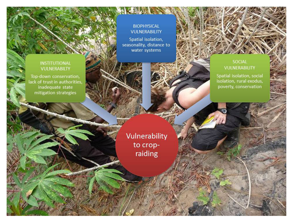
Fig. 1 Vulnerability to wildlife foraging on crops: An interdisciplinary investigation in Loango National Park, Gabon (Emilie Fairet). Emilie and Kharl Remanda investigate signs of crop-foraging in a field near Loango National Park. Red indicates the overall focus of the study; green, use of social science methods; blue, use of natural science methods.

Emilie first investigated the context of conservation at her study site, and how this limits, or intensifies, conflict over wildlife. She showed that protected areas were implemented as a top-down conservation strategy in Gabon. The process excluded local populations from the decision-making processes and eroded or prevented feelings of ownership over their natural resources in local people, thus contributing to institutional vulnerability. This lack of trust prevents communication that would be beneficial to both the people and the national park. Emilie also found that people in Loango have an understanding of sustainability that shares common ground with Western conservation principles. However, farmers cite crop-foraging as the major reason for disliking protected areas and conservation, and these sentiments can result in unobtrusive subversion of conservation efforts, such as feigning ignorance of known conservation laws and legal processes to oppose the imposition of conservation strategies while