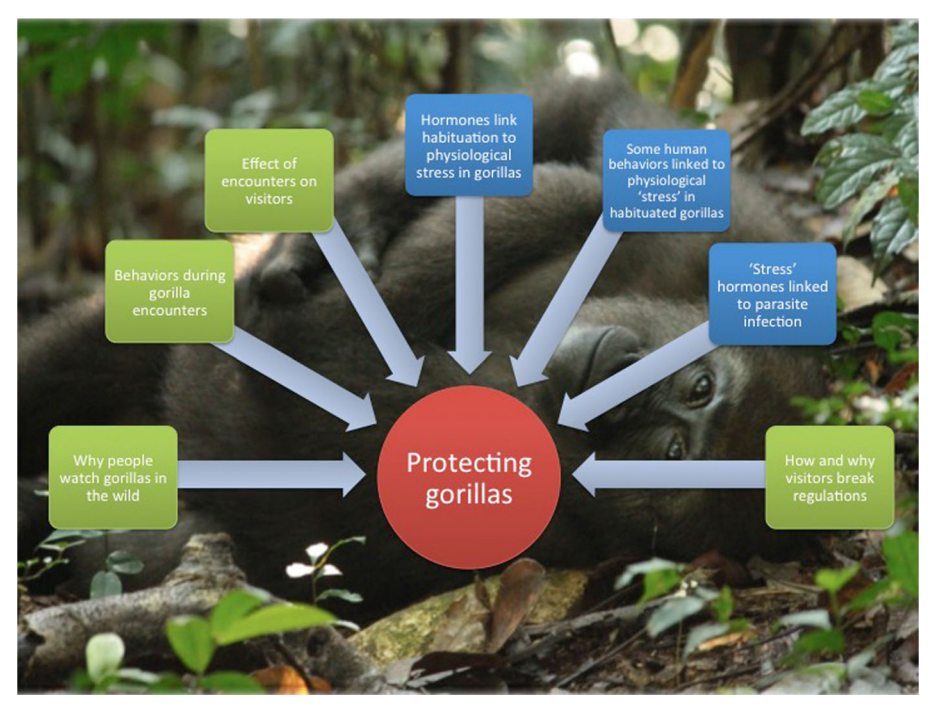
Fig. 2 Wildlife tourism and conservation: An interdisciplinary evaluation of Western lowland gorilla ecotourism in Dzanga–Sangha Reserve, Central African Republic (Kathryn Shutt). A young Western lowland gorilla habituated for tourism. Red indicates the overall aim of the study; green, use of social science methods; blue, use of natural science methods.

and research activities in the Samburu district of Kenya (Kuriyan 2002). However, the effective inclusion of local people in conservation initiatives is a complex undertaking. Poor relationships between the various actors involved, along with imbalances in power relationships, have caused many conservation strategies to fail (Geoghegan 2009; Russell and Harshbarger 2003), with Emilie's study documenting one example of a lack of trust and engagement between local people and officials (Fairet 2012). Siân runs Barbary Macaque Awareness and Conservation, a conservation project for the Endangered Barbary macaque ( Macaca sylvanus ) in Bouhachem forest, Northern Morocco. For her doctoral research, Siân was thus able to practice participatory action research, a style of research that entails sustained engagement and building of trust with participants in a project. Siân's aim was to investigate how effective ethnographic methods could be toward creating a conservation strategy that involves local people and draws on their extensive ecological knowledge.